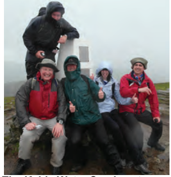
The Kelda Water Services team reach the summit

The conditions on the day were very challenging with poor visibility and driving rain at both locations but the teams were spurred on by the the thought of a roaring campfire and a well deserved barbecue waiting for them at the end and successfully raised £770 and £100 respectively for their efforts. Well done to both teams involved!